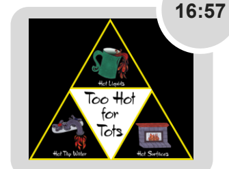
THFT (FULL LENGTH)